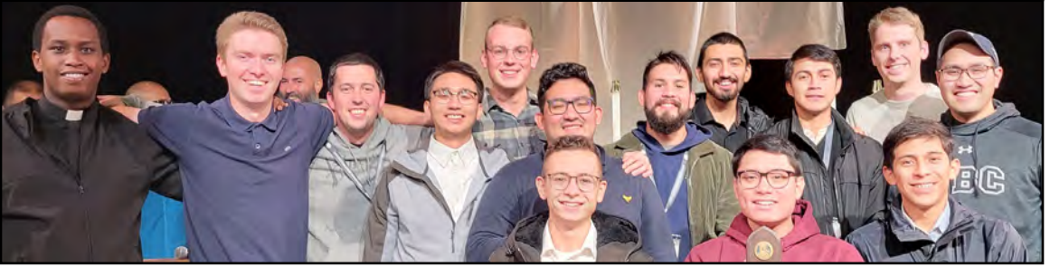
Seminarians of Christ the King and Redemptoris Mater at the Men's Retreat at RockRidge Canyon Centre