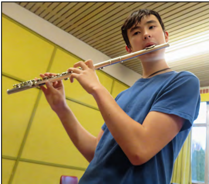
Minor seminarian practicing the flute