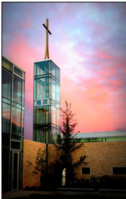
Fr. Michael McGivney Bell Tower at St. Joseph's Seminary in Edmonton

Our next in-person meeting will be in October 2024 at St. Augustine's Seminary in Toronto.