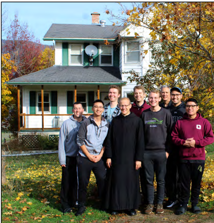
Seminary community in front of the Carmelite nuns' old farm house

Overall, it was an enjoyable experience with time to just be with our brother seminarians and work. It was also formative to see a little bit into the life of the Carmelite nuns, who dedicate their whole life to praying and supporting the Church and the world.