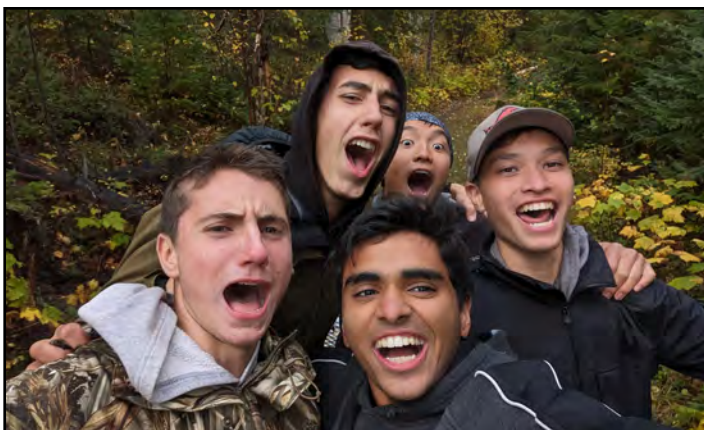
Grade 12s being themselves

whom the boys named Remy. This infamous little creature was quickly discovered upon the group's arrival at the cabin. The nights were spent by some in agony, as the pitter patter of little feet scurrying along would awaken them from their