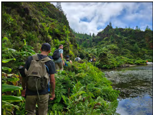
Walking alongside one of the volcanic lakes in the Azores

The next morning, we wandered the streets of Fatima, Portugal. While the old basilica was closed, the rest of the venue was open for prayer and pondering. “It was edifying to see the place where the three children grew up,” described Aby Vandanath.