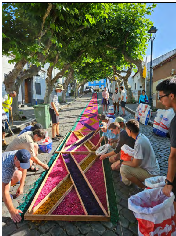
Seminarians help prepare a traditional flower carpet in the Azores