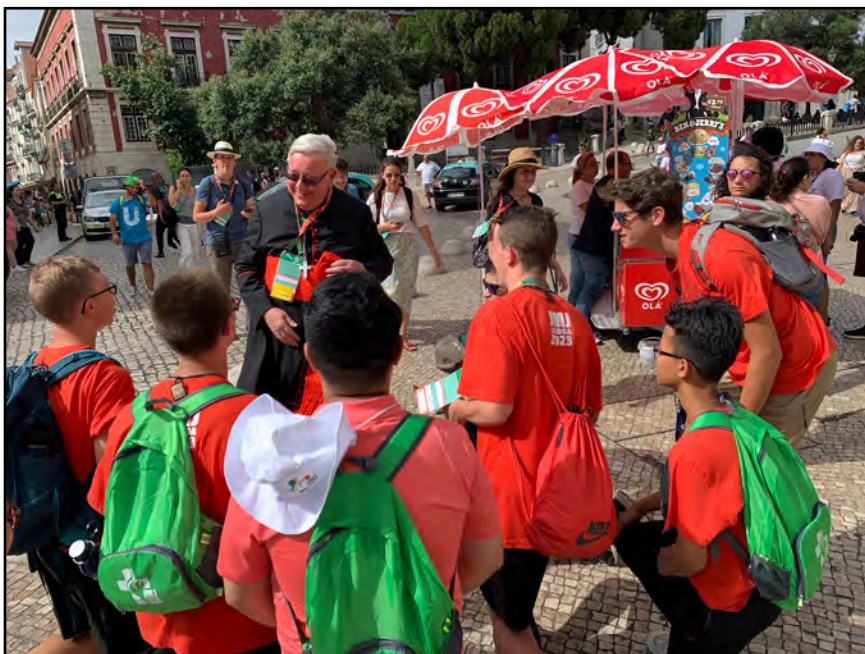
Minor seminarians meet Jean-Claude Cardinal Hollerich, S.J. on the streets of Lisbon