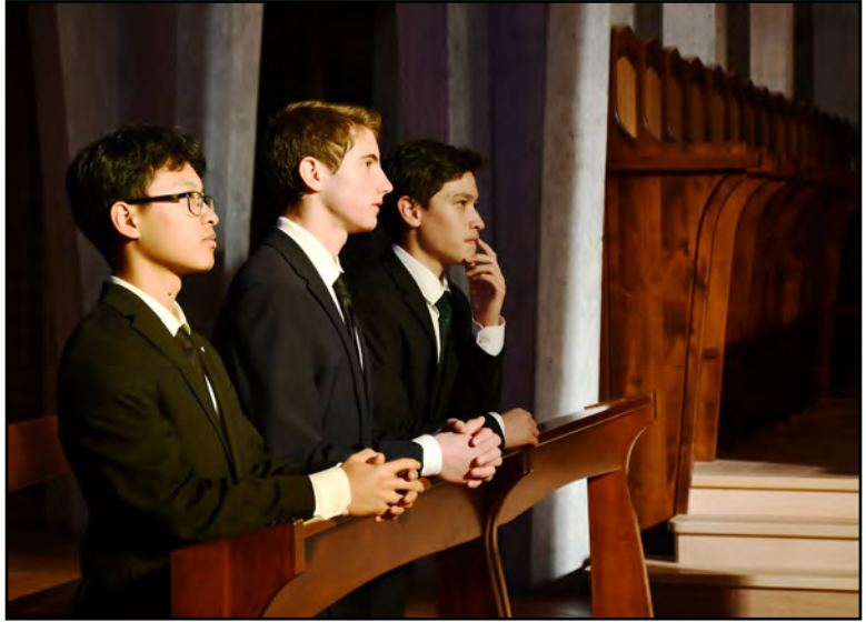
Minor seminary student executive

Thu 19: The seniors got to go to the Celebrate