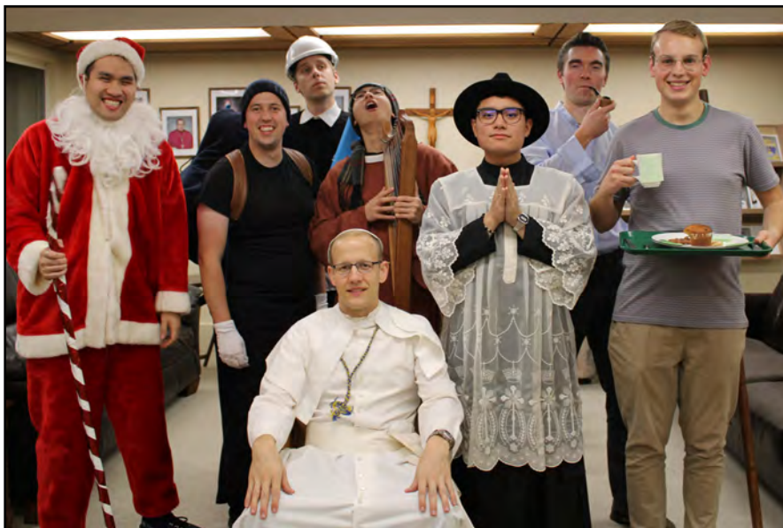
All Saints Party