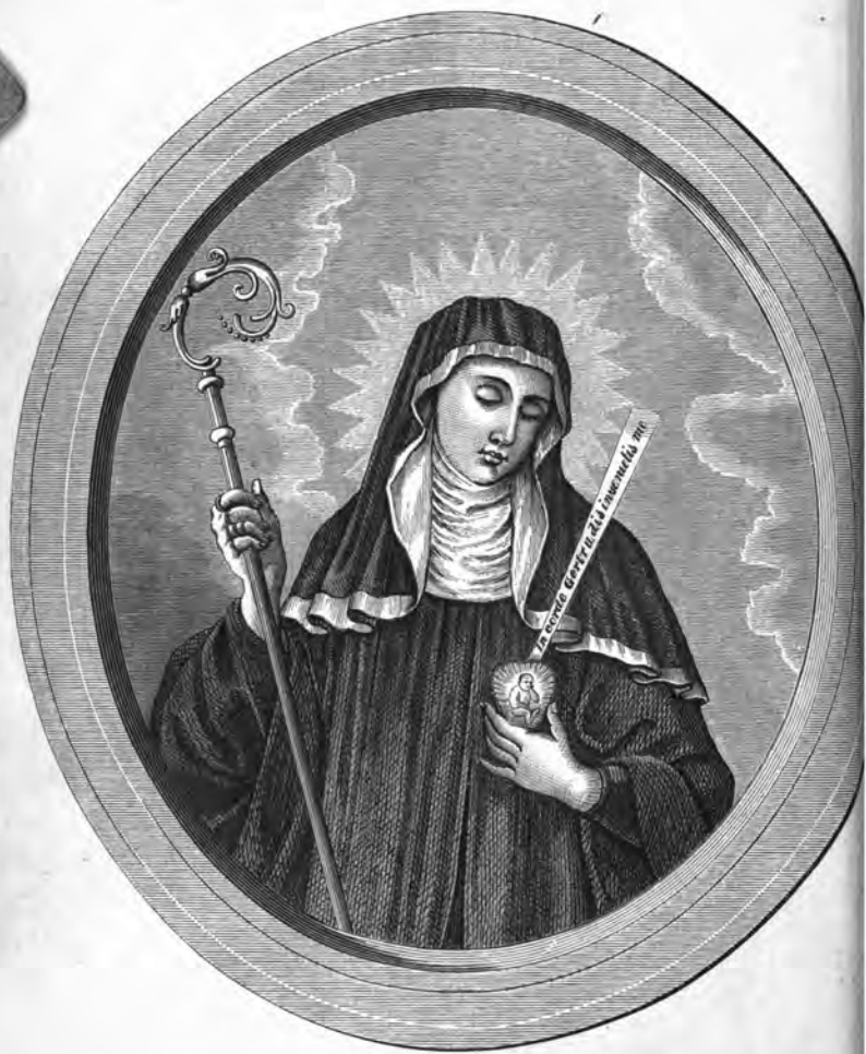
ST. GERTRUDE THE GREAT.

Engraved from the Spanish miraculous Painting.